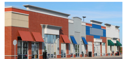
CPP LRO strip center TIV $4.6M