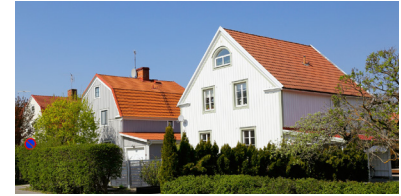
CPP Dwellings 4 family TIV $1.1M