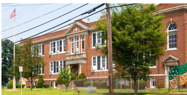
CPP Pre-K and elementary school TIV $2.6M