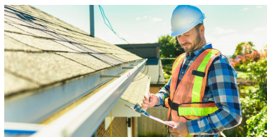
CPP Roofing contractor with office and BPP TIV $1M