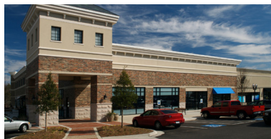
CPP LRO shopping center TIV $5.8M