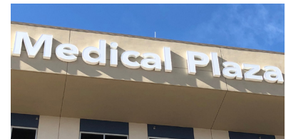
CPP LRO Medical office plaza TIV $1.5M