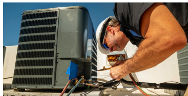
CPP HVAC contractor and office TIV $1.5M