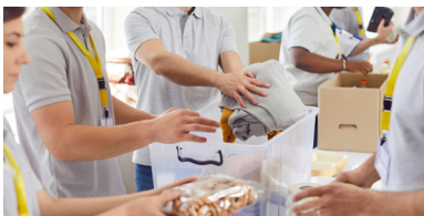
CPP LRO occupied by non-profit TIV $2.3M