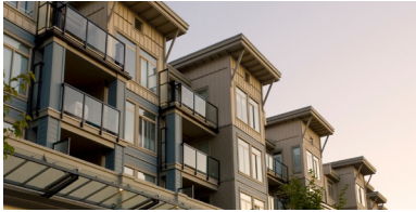
CPP Condo unit owners Tenant Improvements or Betterments $3M