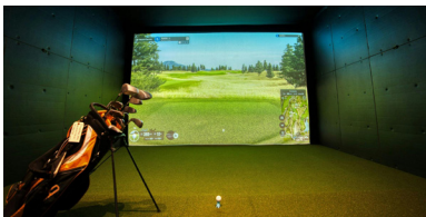
CPP Golf simulator facility including lessons TIV $1M