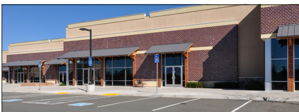
LRO Strip Center