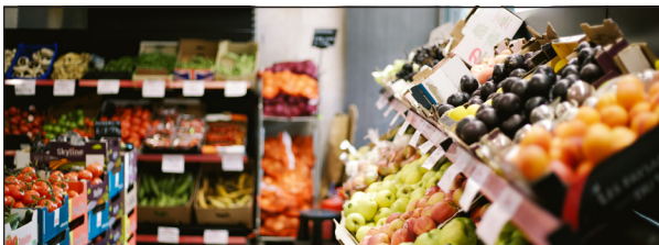
LRO Grocery Store