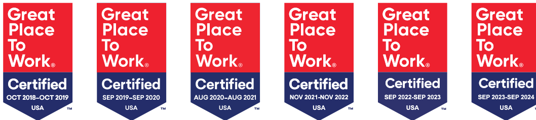
Great Place to Work® 6 Years in a Row

Our employees propel IAT forward – driving innovation, stable partnerships and growth. That’s why we continue to build an engaging workplace culture to attract and retain the best talent.